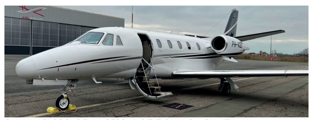
CESSNA CITATION XLS | PH-KEK