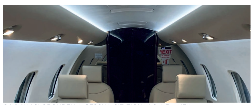
CESSNA CITATION XLS | PH-KEK